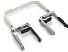
Tub security rail